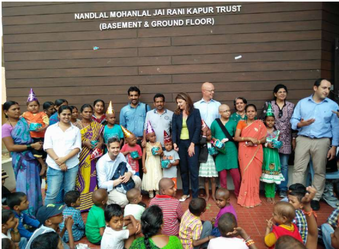
Above: Birthday Party Celebration sponsored by Societe Generale Bank, Paris and Bangalore Below: Nurses of KMIO enjoying the birthday party celebration