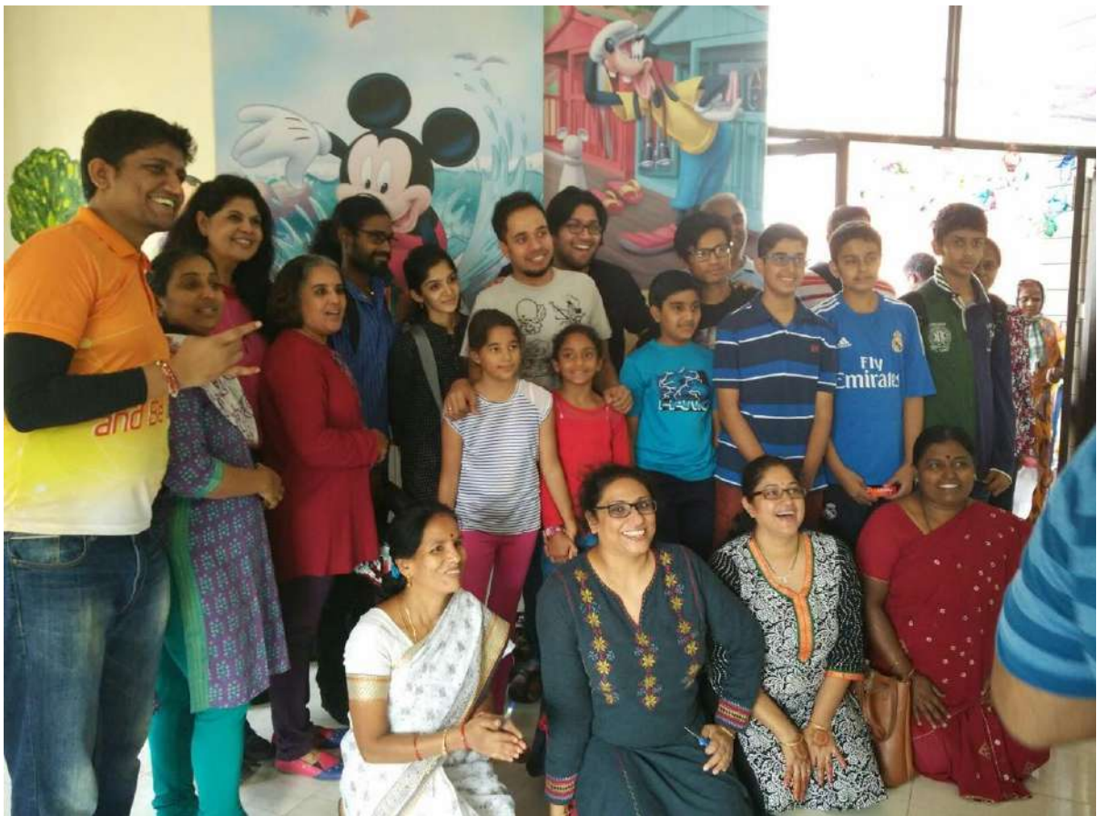
Photo: Team UTSAV and our other Friends from the Shubham Music School with Team Samiksha

To record the infrastructure and material improvements provided by Samiksha Foundation at the facility and the environment, and how this change has affected overall, for the children.