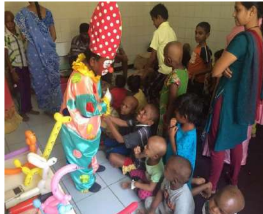
Birthday and gifts by our resource partners Jumpori.