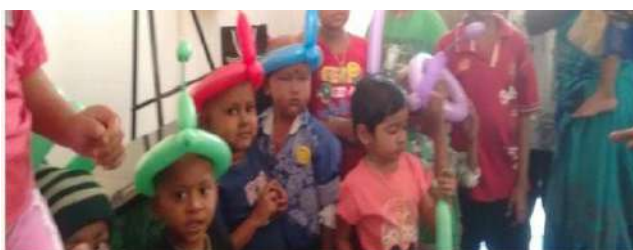
Balloon sculpting on one of the birthdays