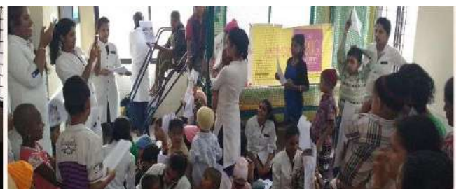
Activities by students from Maharani College