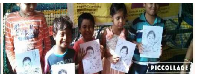
Caricature by Jumpori team