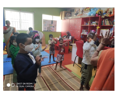
children occupied at the pediatric ward play room at SFLC@MSCCNH - photos taken in Sept 2021